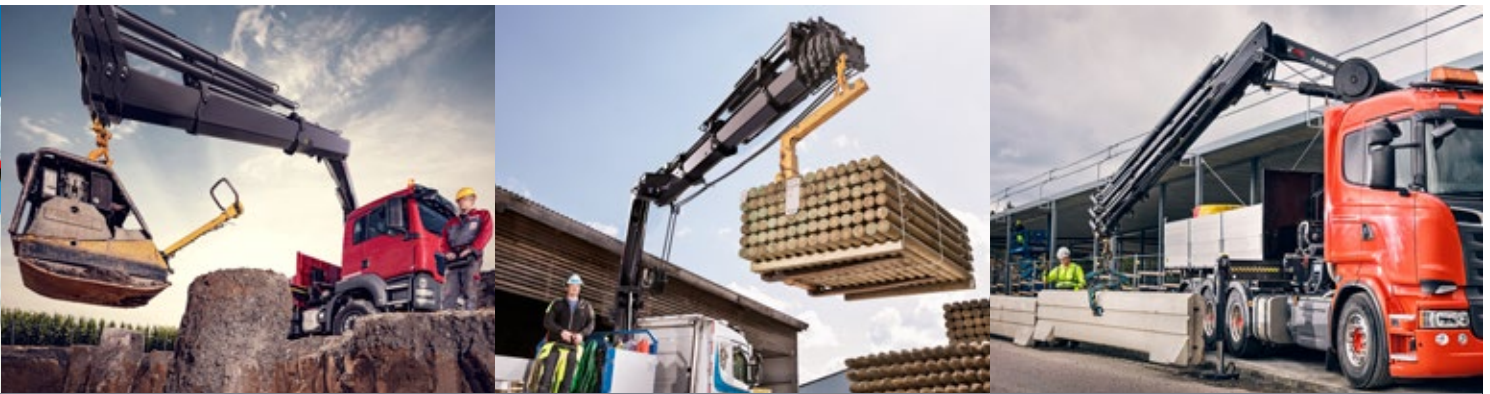
HIAB X-HIDUO 228

Certain HIAB mid-range crane models are also available with an EP boom system, where the E-link construction has been optimised for fewer but longer extensions. This unique construction provides even more power for lifting close to the truck.